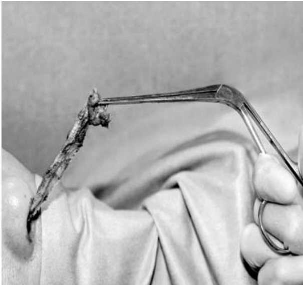
FIG. 3 Removal of whitehead's pack

craniofacial resection) may be packed for 10 days. Although Whitehead's varnish has an antiseptic effect, antibiotics are prescribed for the duration of the pack, as the ribbon gauze still represents a foreign body in the nasal cavity. Removal of the pack (Figure 3) should be performed under a general anaesthetic as it can be quite painful.