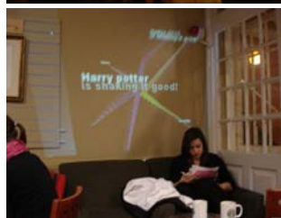
Figure 2. Projection at Café [16:25 pm, 14 Dec. 2007, Bath]