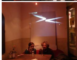
Figure 3. Projection at the Cafe [20:30 pm, 19 Jan. 2008, Weimar]