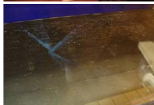
Figure 4. Outdoor Projection [17:10pm, 13 Dec. 2007Bath]