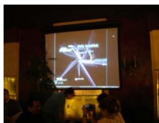
Figure 1. Projection at the Pub/Club [22:45pm, 13 Dec. 2007, Bath]