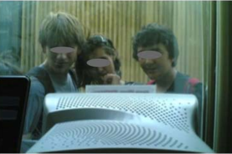
figure 4 . Screenshots of our installation with the Bluetooth encounter prototype. The location was on our campus, and the screen was installed behind an office window.

In terms of encounter, this system typically provides an unconscious-intentional encounter, with users gradually becoming more aware of the encounter as they notice the screen and realise that their name is displayed on the screen. In other words, users consciously enable Bluetooth on their devices, but the interaction with the display is in most cases unintentional. Of course, the interaction can be unconscious-unintentional, which was the case with some users who simply did not know that their phone actually had Bluetooth. For instance, one person was baffled by the fact that their phone was picked up by our Bluetooth scanner when her phone "does not have strong signal on campus".