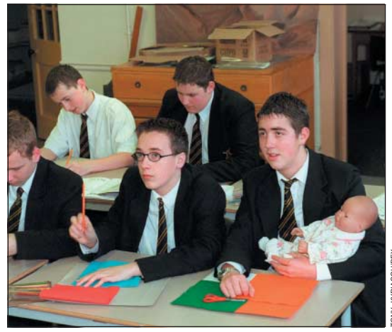
Baby talk: the most effective sex education?

Although "process" and "qualitative" are often used interchangeably, data for process evaluation can be both quantitative and qualitative. For example, in a series of systematic reviews of research on health promotion and young people, 33 (62%) of 53 process evaluations collected only quantitative data, 11 (21%)