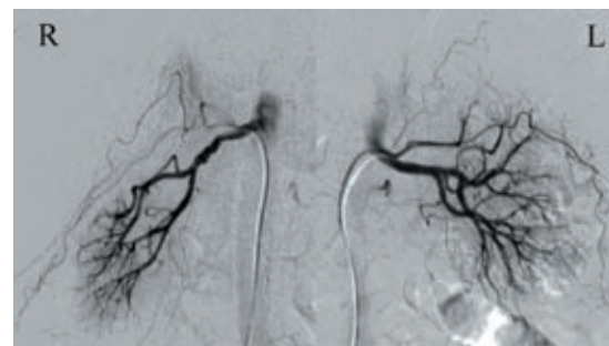
Fig 1 The patient's bilateral renal angiography showing normal renal vessels

The table summarises the other investigations and blood tests. These were negative except for a strongly positive speckled antinuclear antibody at a titre of more than 1/1000. The staining pattern was consistent with