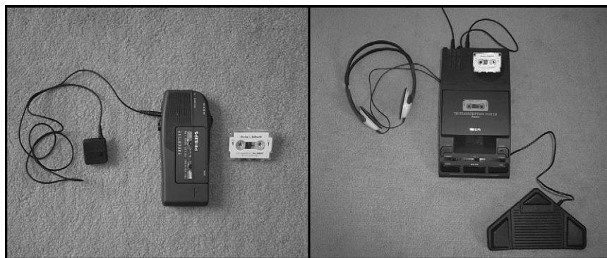
FIGURE 1 Analogue audio recording equipment: dictaphone with microphone and mini-cassette tape and foot-pedal controlled transcription machine with headphones

Transcribing is an interpretive act rather than simply a technical procedure, and the close observation that transcribing entails can lead to noticing unanticipated phenomena. It is impossible to represent the full