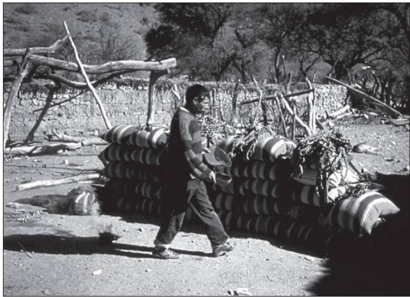
Figure 1. Itinerant potter from Ticatica, Potosi, Bolivia with 34 sacks of maize acquired in exchange for the pottery he made. Before his return home he is making a burnt offering (smoking to the left) and libations of chicha (from the gourd in the potter's hand) for the maize and his safe journey.