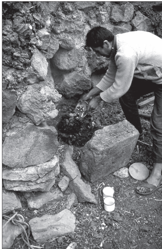
Figure 4. Raqchi, Dept. Cuzco, Peru. At the corner of a field, next to an Inca carved stone, where this household always burns their offering. The father has prepared a small animal dung fire onto which he places the offering of coca leave k’intus, maize kernels, animal fat and herbs, he then added the alcohol and sprinkled some chicha from the cups by his feet before we returned to his house while the fire consumed the offering for the apu.

In the fifteenth and early sixteenth centuries Inka state ritual specialists prepared elaborate offerings that involved the sacrifice of carefully selected objects and sometimes animals and children. For instance capacocha offerings were prepared in Cuzco and sent to many different locations. These could include mullu ( Spondulus shells from the Ecuadorian coast),