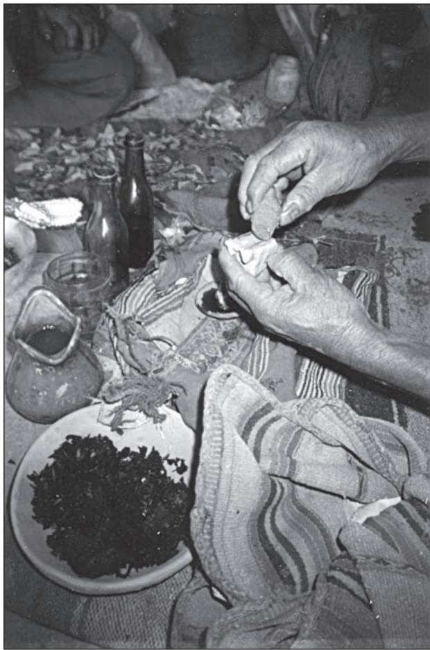
Figure 3. Raqchi, Dept. Cuzco, Peru. At the start of preparing the second k'intuqwi offering, which gives thanks for, and requests the, health and fertility of the household's animals. The carved stone illa of a plough team is marked using the same hematite-rich clay used to mark sheep and llamas and to paint pottery. The bowl of coca leaves chewed during the preparation of the offerings, the content of the small bottles of alcohol and wine, and the little jug of chicha will all be included in the burnt offering ( dispachu ). At the centre of the photograph, behind the father's hands a small bowl (referred to as a cocha or lake, evoking the place from which the animals are thought to have originated) is filled with wine which the small illa of a sheep within it drinks from.

1985). Illas are a source of life and productivity, during rituals they are said to be drinking the chicha and chewing the coca given in the offerings (Allen 1988, 54, 150). Miniatures are frequently used in Andean rituals either as offerings or, as in this case, to act as a channel to transfer offerings from people to the apus (Sillar 1996). I have observed about ten of these offerings being prepared in Raqchi between 1987