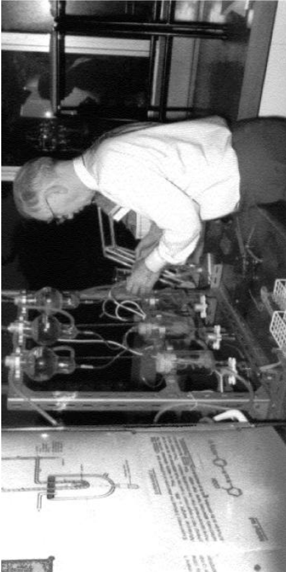
Figure 1. The late Professor R.B. Fisher setting up a demonstration of perfused small intestine at the Southampton meeting of the European Intestinal Transport Group in 1980. The apparatus here comprises three identical sets of Fisher and Parsons's apparatus modified by removal of the circulating serosal fluid. This demonstration showed the sustained absorption of fluid, but not phenol red, in the presence of luminal glucose by rat small intestine in vitro; the failure of the intestine to absorb fluid when luminal glucose was absent; and the active transport against a concentration gradient of methyl red. A key feature of this preparation was that the organ was never deprived of adequate oxygen, even momentarily, during setting up from an anaesthetized animal and subsequently.