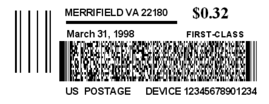
Figure 5. An example of a high capacity 2D barcode, known as PDF417. It is used here in a design for the U.S. Postal Service's proposed new personalised, secure postage stamp.

At their simplest, 'smart labels' such as 2D barcodes are really extensions of existing systems of object identification except that they hold more data, but more sophisticated technologies such as RFID (Radio Frequency identification) tags represent and communicate the code quite differently. The goal is to provide objects some level of 'awareness' and an ability to communicate over short distance using wireless networking technologies (Want et al, 1999).