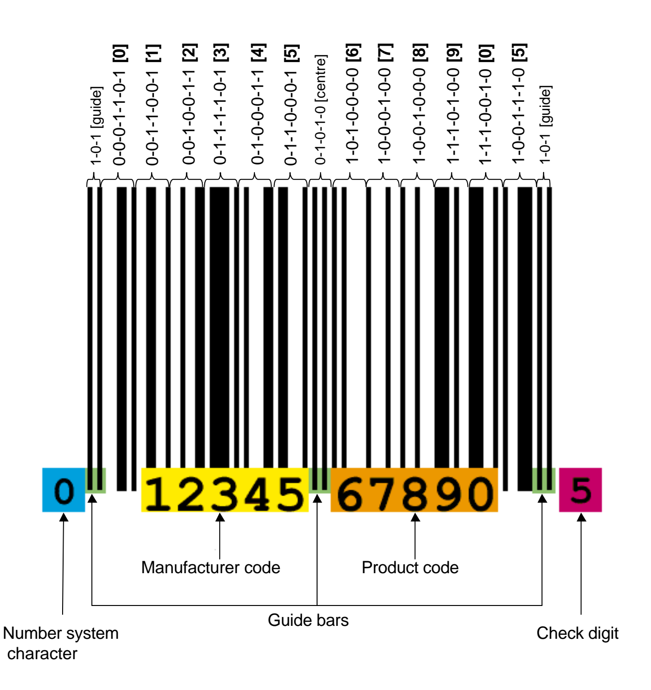
Figure 2. Decoding the barcode. Shown is a 12 digit UPC (universal product code) barcode used in the U.S. and managed by the Uniform Code Council. Each digit is encoded as a binary number, represented by a particular sequence of seven black bars (1) and white spaces (0). The number 3 for example is represented by the sequence: space-bar-bar-bar-bar-bar-bar (0111101). The binary representation in the left and right hand sides are inverses of each other, so the barcode can be scanned from either direction.

The barcode only provides a single identification code number, the rest of the details describing the object (e.g. product type, date of manufacture, price, etc) have to be held in a information system. In this way the true importance of barcodes is that they