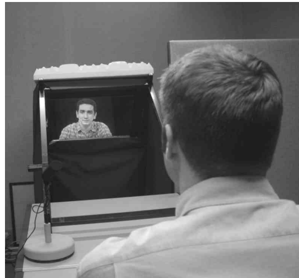
Figure 1: Video tunnel setup showing the video condition

The sound was recorded using an AKG C747 microphone placed on the desk. As the audio stream drove the avatar's lip and eye movements, we needed to isolate each microphone from incoming sound from the other room. We therefore equipped participants with Sennheiser HD265 headphones. In the inferred-gaze condition a copy of the audio stream was sent to the computer, along with head position information from the Polhemus Isotrak II tracking system.