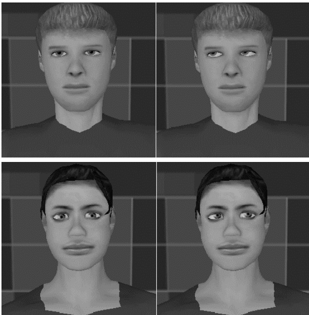
Figure 2: Face-on view of male and female avatars looking "at" and "away" from partner

"while speaking" and "while listening" modes whose timings were taken from research on face-to-face dyadic conversations [3, 4, 12]. For the "while speaking" mode, mean duration of gaze was 1.8 seconds for "at partner" gaze, and 2.1 seconds for "away" gaze, with an average frequency of 14 "at partner" glances per minute. For the "while listening" mode, mean duration of gaze was 2.5 seconds for "at partner" gaze and 1.6 seconds for "away" gaze, with an average frequency of 17 "at partner" glances per minute. For "at partner" gaze, the avatar's eyes focused directly ahead. The values for vertical and horizontal angles of "away" gaze were chosen randomly from a uniformly distributed range of 0 to 15 degrees. The sign of the angle was random. In order to avoid repeating identical animation loops the duration of "at" and "away" gaze was randomised using the waiting time exponential distribution.