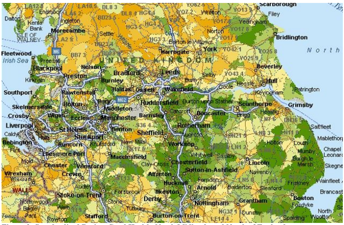
Figure 2: Standardised Ratios: Good Health, North Midlands and North of England