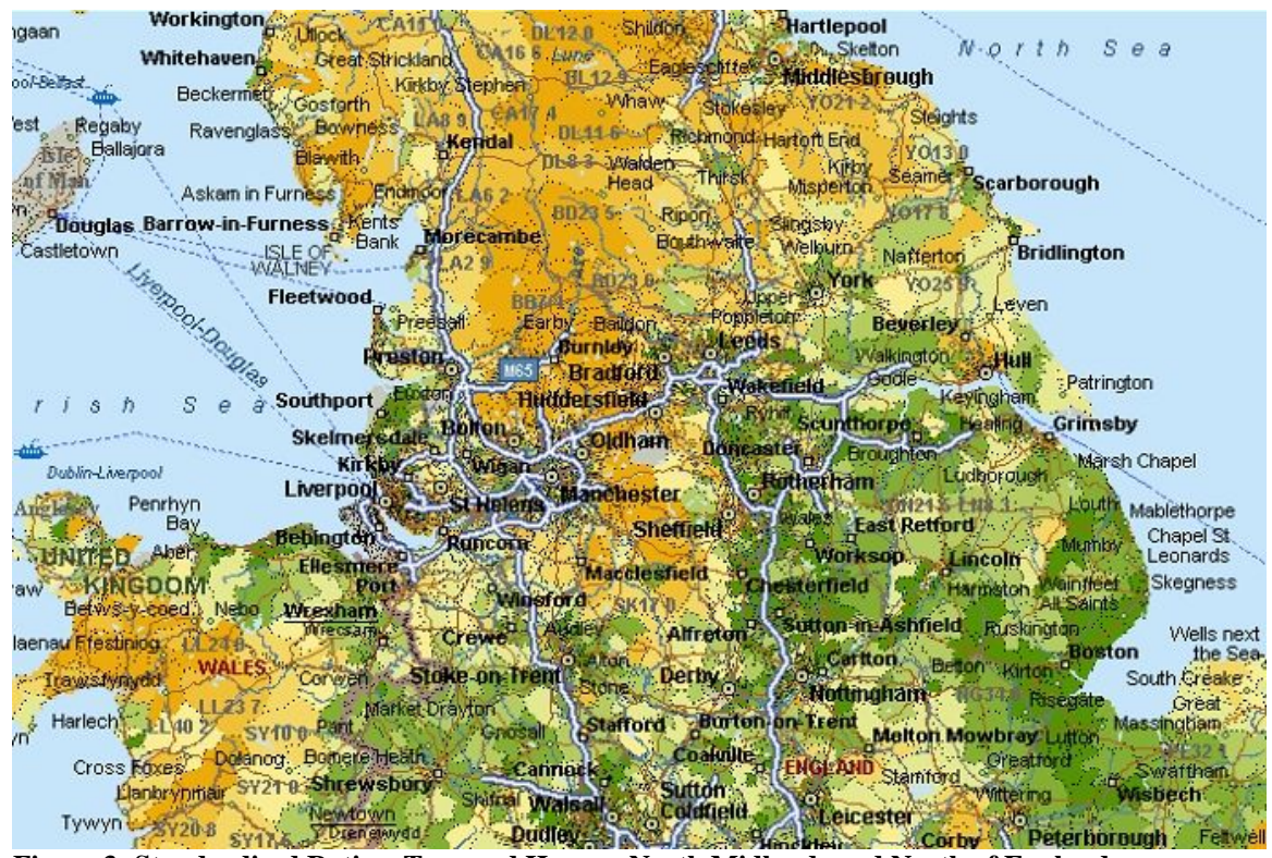
Figure 3: Standardised Ratios: Terraced Houses, North Midlands and North of England