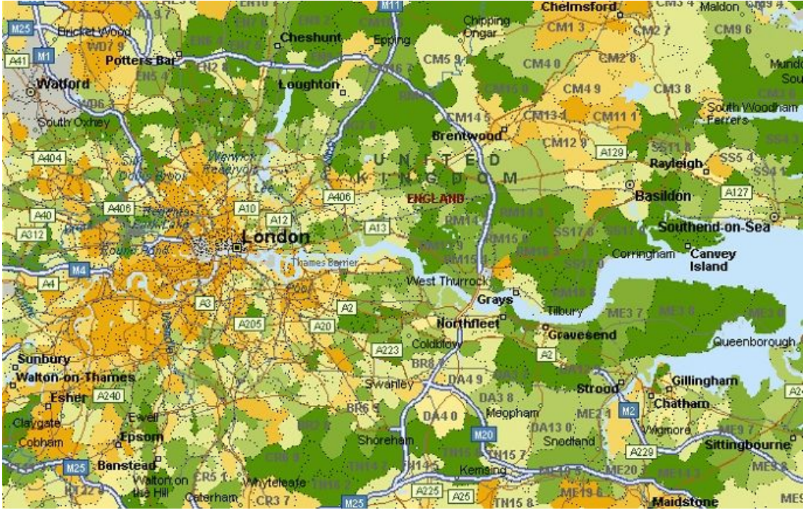
Figure 4: Standardised Ratios: Social Grade AB, London and Thames Estuary