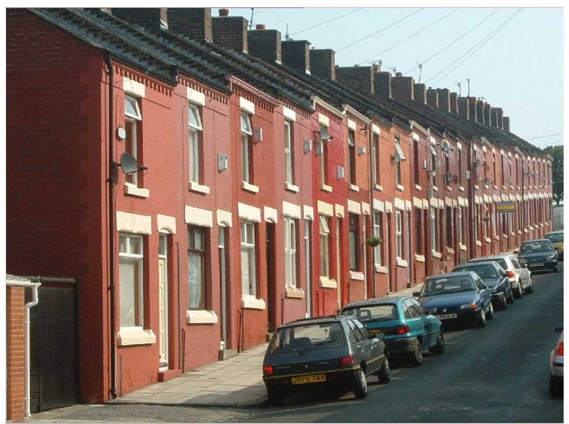
Figure 6: Liverpool 8 (L8 4) : The Standardised Ratio for Christians is 116