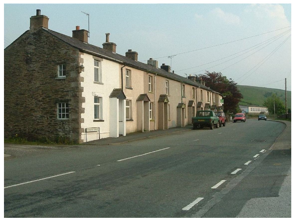
Figure 5: Tebay, Cumbria (CA10 3): The Standardised Ratio for Terraced Houses is 136.