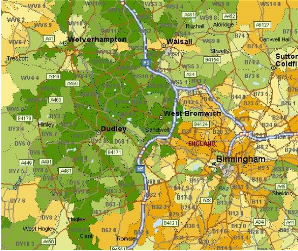
Figure 1: Standardised Ratios: Lone Parent Households, Birmingham and Black Country