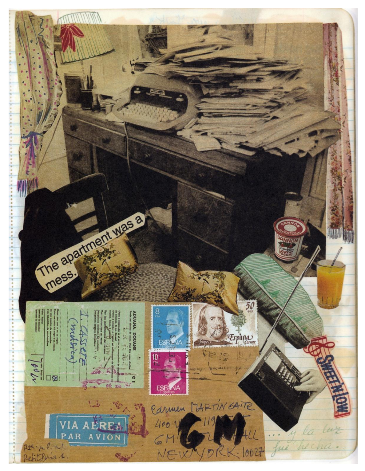
Figure 2. Here, in a self-mocking way, the author suggests, by use of cuttings, the untidiness of her apartment and work desk. However, the faint quotation from the Book of Genesis, in the bottom right-hand corner, '... y la luz fue hecha', optimistically indicates that she is writing, creating. Also, the inclusion of the package from Spain that had contained a cassette of music, the picture of the radio, and the insertion of the treble