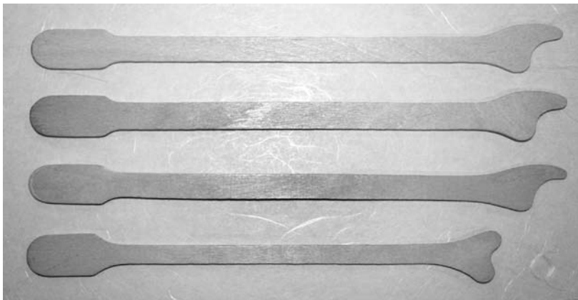
Figure 6: Three Aylesbury spatulas and one Ayre spatula, 2009.

The Ayre was the Department of Health spatula, replaced as the spatula of choice by the Aylesbury from 1984 onwards.