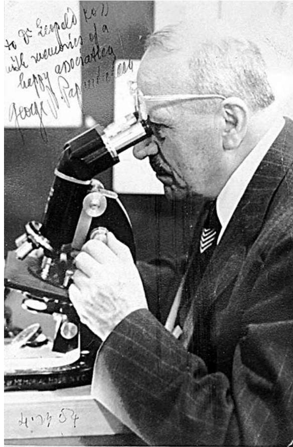
Figure 7: Dr George N Papanicolaou at the microscope. Photo inscribed to Leopold G Koss on 23 April 1954.

presented by Laverty et al. from Australia in 1978. 248 Presumably, it is this work that generated the interest of virologists in papillomavirus in biopsies of the uterine cervix and the beginning of classification of viral types, as shown by zur Hausen and Gissmann. 249 There were many other contributors to this sequence of events that led to subclassification of human papillomaviruses into low-risk and high-risk types and to antiviral vaccines.