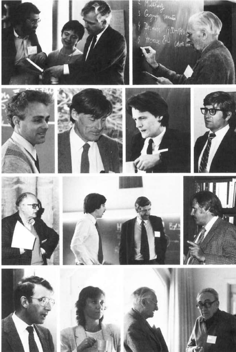
Figure 3: Contributors to the 1985 Banbury Center conference on 'The origins of female genital cancer'.