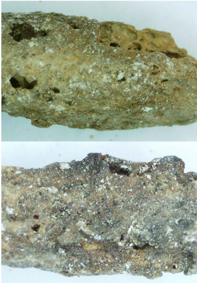
Figure 2. The phalanx with suspected pathology.