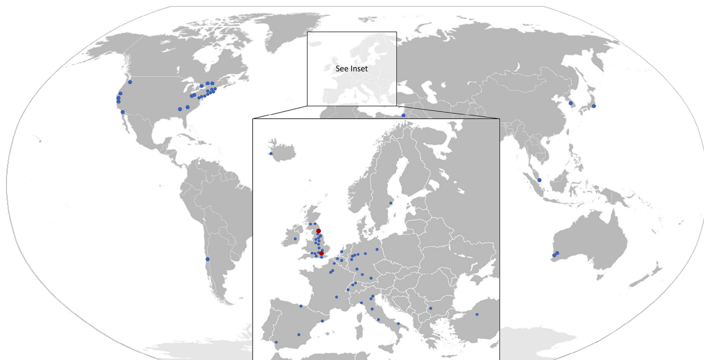
Fig. 3. Distributed samples within the UK and worldwide. Worldwide distribution of Newcastle MRC Centre Biobank samples. Countries that have received samples from the biobank include the UK, USA, Japan, Australia, Spain, France, Germany and Italy.