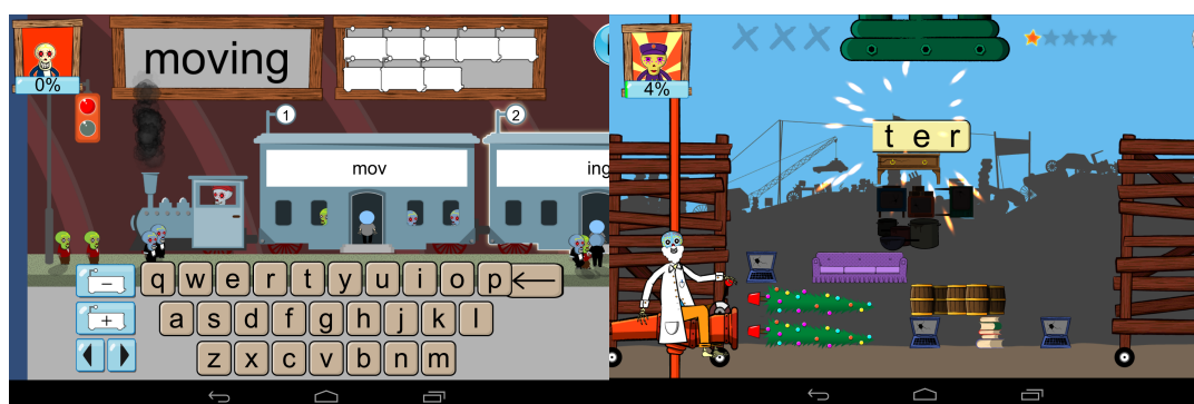
Figure 1 – Two mini games from Words Matter

Train dispatcher game mechanics require the child to type the syllables of a given word into the train carriages. When the child provides the correct answer, the train departs.