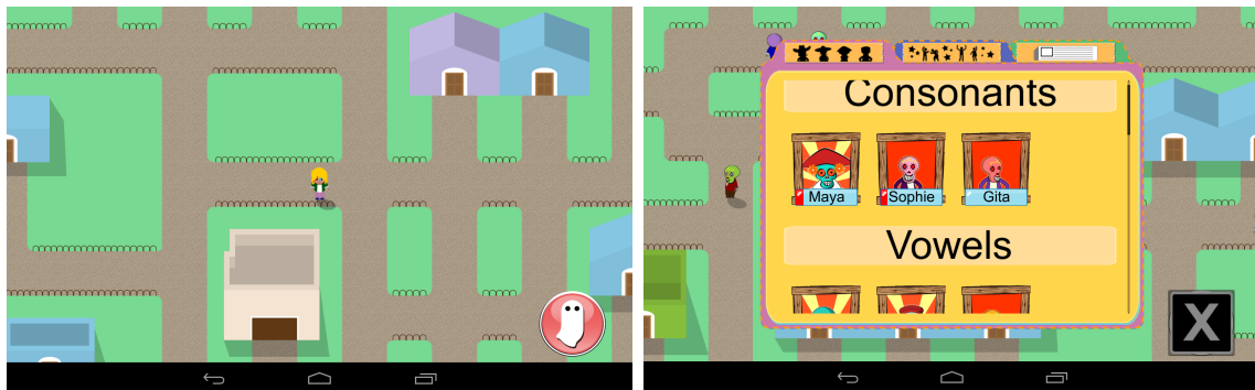
Figure 2 – Navigation and ‘Ghostbook’ Design

2a: The player can identify characters through the map and click on them to access individual mini games