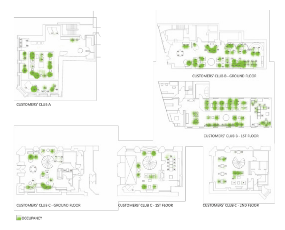
Figure 2 - Density maps for overall occupancy patterns produced by snapshot method - denser shade represents more popular seats

Firstly, the distinct furniture types (figure 1) were plotted against seat occupancy to investigate differences in popularity by furniture type. The analysis of variance (ANOVA) illustrated a moderate and significant correlation of variance (R2=0.29 p<0.001), which indicates that furniture type plays a role for seat selection but is not the main driver. The analysis highlighted that people preferred more comfortable seating; specifically, a distinct preference for individual armchairs emerged since this type of furniture recorded the highest mean occupancy (46% for type 2 and 46% for type 4). Sofas as well as booth areas illustrated average occupancy levels close to 40%. The least preferred furniture type was the entrance bench.