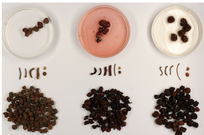
Fig. 3. Left: Kew reference drug of Nan Wu Wei Zi (fruit of Schisandra sphenanthera , EBC 80419). Middle: sample traded as ‘Wu Wei Zi’ (EBC 83897, dispenser 7), identified as Nan Wu Wei Zi ( S. sphenanthera ) and dyed (middle petri dish). Right: Kew reference drug of Bei Wu Wei Zi (fruit of S. chinensis , EBC 80572). Top row: the 3 samples after brief immersion in water. The ruler indicates 1 mm.

The marked difference in quality between drugs harvested from the wild, of which 36% of samples were either of the incorrect