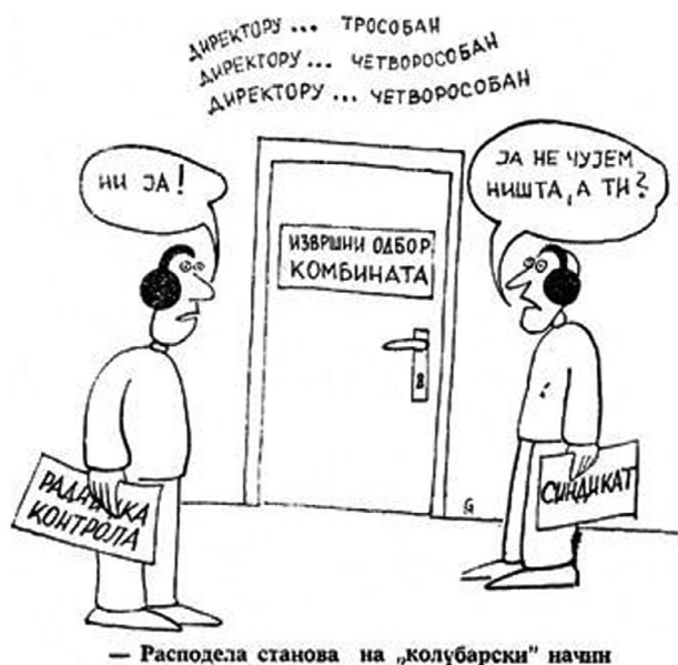
Figure 3. Cartoon from workplace periodical Kobubara (August 1978) 'The distribution of flats the "Kolubara" way'.

Source: Živanović, "Kako je Milan Gambelić osetio moć karikature".