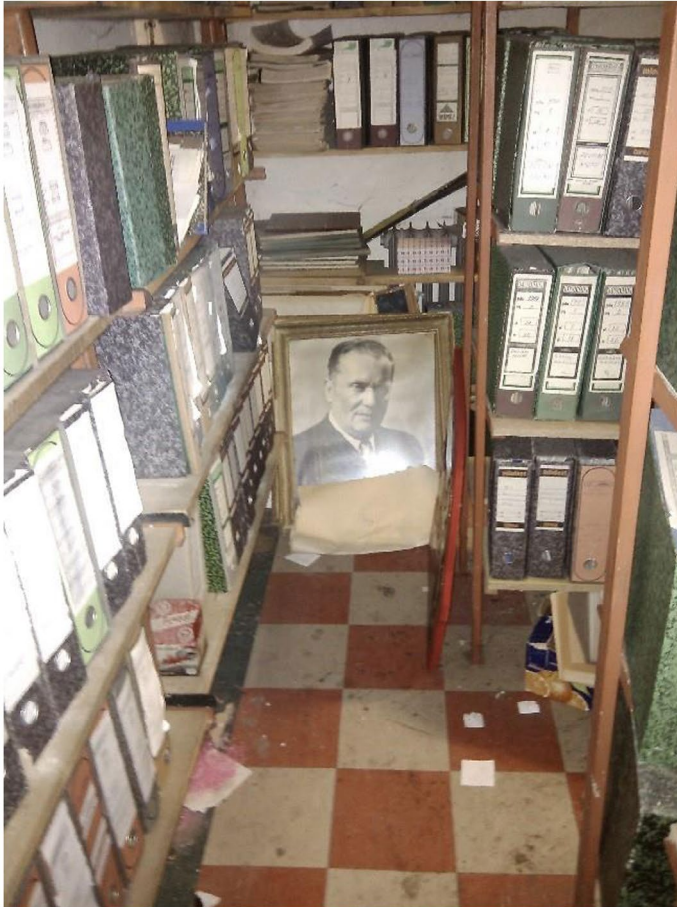
Figure 1. FAP archive, Priboj, April 2015.

When the archives are still located within the factory, access is problematic and highly personalized (i.e. dependent on making the right connections to ensure access). We were fortunate to be able to access in situ archives in one case study location, Priboj in south-west Serbia (Sandžak). The ailing heavy vehicle manufacturer is owned by the Serbian state and in early 2016 is still awaiting privatization after numerous failed attempts to find a buyer and sporadic strikes. Through formal requests from our institution, the fostering of personal connections and good luck, one-time access was secured and we were able to access the factory archives in 2015 (Figure 1). Inside the archives however, we encountered numerous shortcomings. Much of the documentation was incomplete, disorganized, and usually tended to be biased towards management. For example, when exploring the institutions of self-management like workers' council meetings, usually only final decisions tend to be