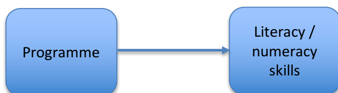
Figure 1: Simple linear logic model of programme impact

mechanisms potentially influencing skills gain. This would enable evaluators to develop what Pawson et al. (2004, p. 2) call a more 'generative' approach to evaluation, in which researchers seek to determine not just what works, but through what mechanisms and in what circumstances. Practitioners can and should play an important role in this process, by helping researchers formulate realistic, practice-based theories of programme mechanisms, outcomes and causal pathways, and helping researchers to develop evaluation designs based on such theories. Programme theory (sometimes referred to as a programme's 'theory of change') describes the direct and indirect causal pathways through which programmes are expected to produce desired outcomes (Chen, 1990; Weiss, 1995). Such pathways may be illustrated via 'logic models' (Kellogg Foundation, 2004; SRDC, 2011), as in Figures 1 and 2 below. Weiss (1995, p. 66) argues that all 'social programmes are based on explicit or implicit theories about how and why the program will work'. Pawson and Tilley (2004, p. 4) make a similar argument in advancing the case for 'realist evaluations', suggesting that interventions are by their very nature theories made manifest and are 'grounded on assumptions' about mechanisms and their relationship to outcomes.