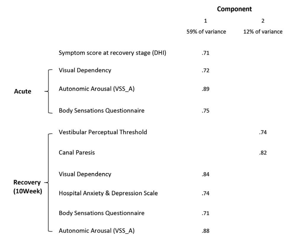
Figure 2. Factor analysis summarizing measures that correlate significantly (before adjustment) with symptomatic recovery (DHI at 10 weeks). Component 1 accounts for 59% of variance within the data set, and component 2 accounts for 12% of variance. For clarity those variables that load strongly (>0.7)<sup>25</sup> on each component are only shown.