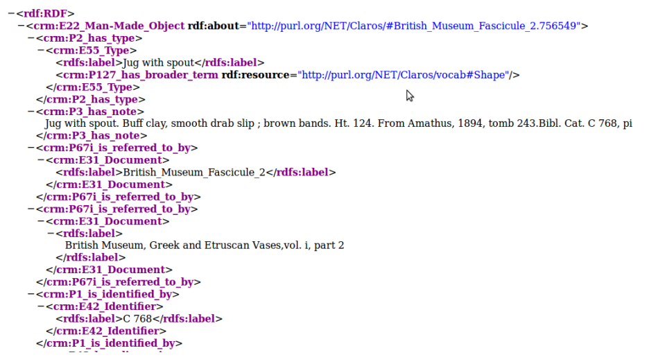
Figure 5. RDF conversion of semantic annotation consistent with CLAROS format

Figure 4. Semantic annotation examples delivered in GATE environment