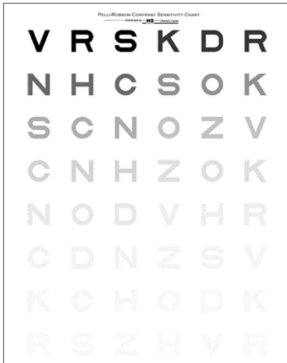
Figure 2. Pelli-Robson contrast sensitivity chart (Precision Vision, LaSalle, IL) 11 The Pelli-Robson contrast sensitivity charts have uniformly large (20/680 Snellen equivalent size) letters of decreasing contrast in a series of triplets. There are two triplets per line and all letters within each triplet have the same contrast level. The Pelli-Robson chart is read at 1 m. It is wall or easel mounted; therefore, luminance of the environment must be accounted for when used for research.

Reprinted with permission from Pelli et al. 11 Copyright © 2014 D.G. Pelli and J.G. Robson. Manufactured by Precision Vision.