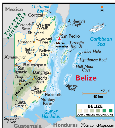
Figure 1: Map of Belize. The site of Marco Gonzalez is located at the south end of the island of Ambergris Caye, ca. 6 km south of San Pedro Town (Reproduced with permission of www.worldatlas.com).

The soil is a natural body of animal, mineral and organic constituents differentiated into horizons of variable depth which differ from the material