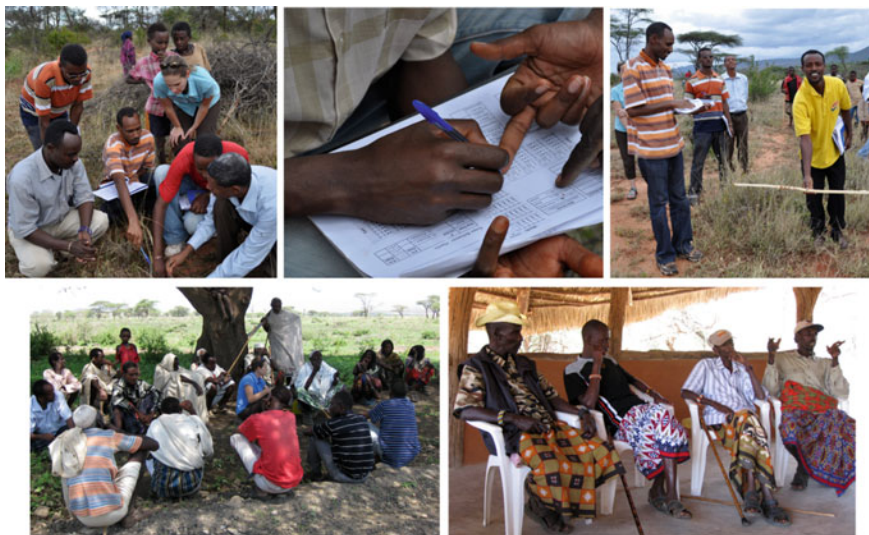
Fig. 13.1 Training sessions of the Northern Rangelands Trust in Kenya.

Guidance was also provided to NRT senior staff as they decided upon a design for their monitoring program. They were then accompanied to the field when they introduced the new monitoring methods in the initial five communities. The NRT