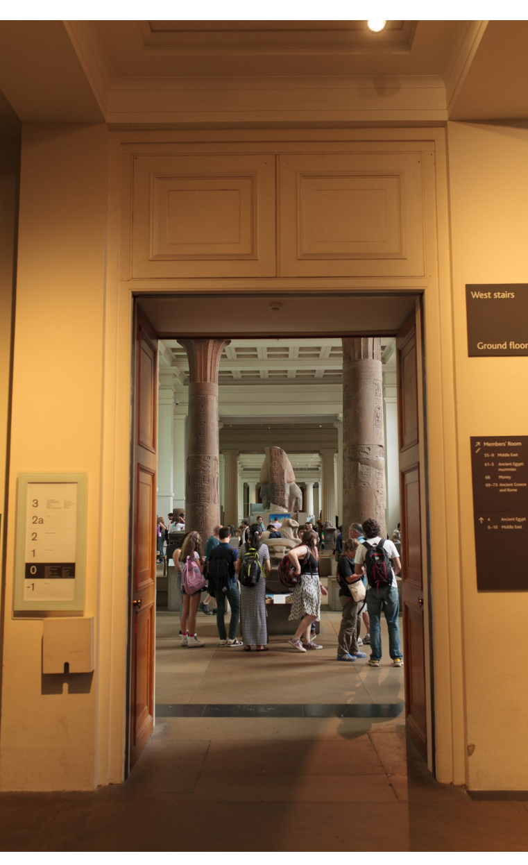
North entrance to Room 4, 'Egyptian Sculpture'.

and large windows, is (unusually and unexpectedly) rather green in colour, its lighting provided by daylight through a glass ceiling. At the opposite end of Room 24 there is a sightline up into Room 33 which is lit by north facing daylight, providing an altogether different reference light. The visual effect of this is a subjective matter, but it could be hypothesized that this lighting situation might lead to Room 24 being viewed as 'dimly' lit, despite light levels which would normally be considered adequate. Observations of visitor movements reveal that visitors tend to focus in the middle of the