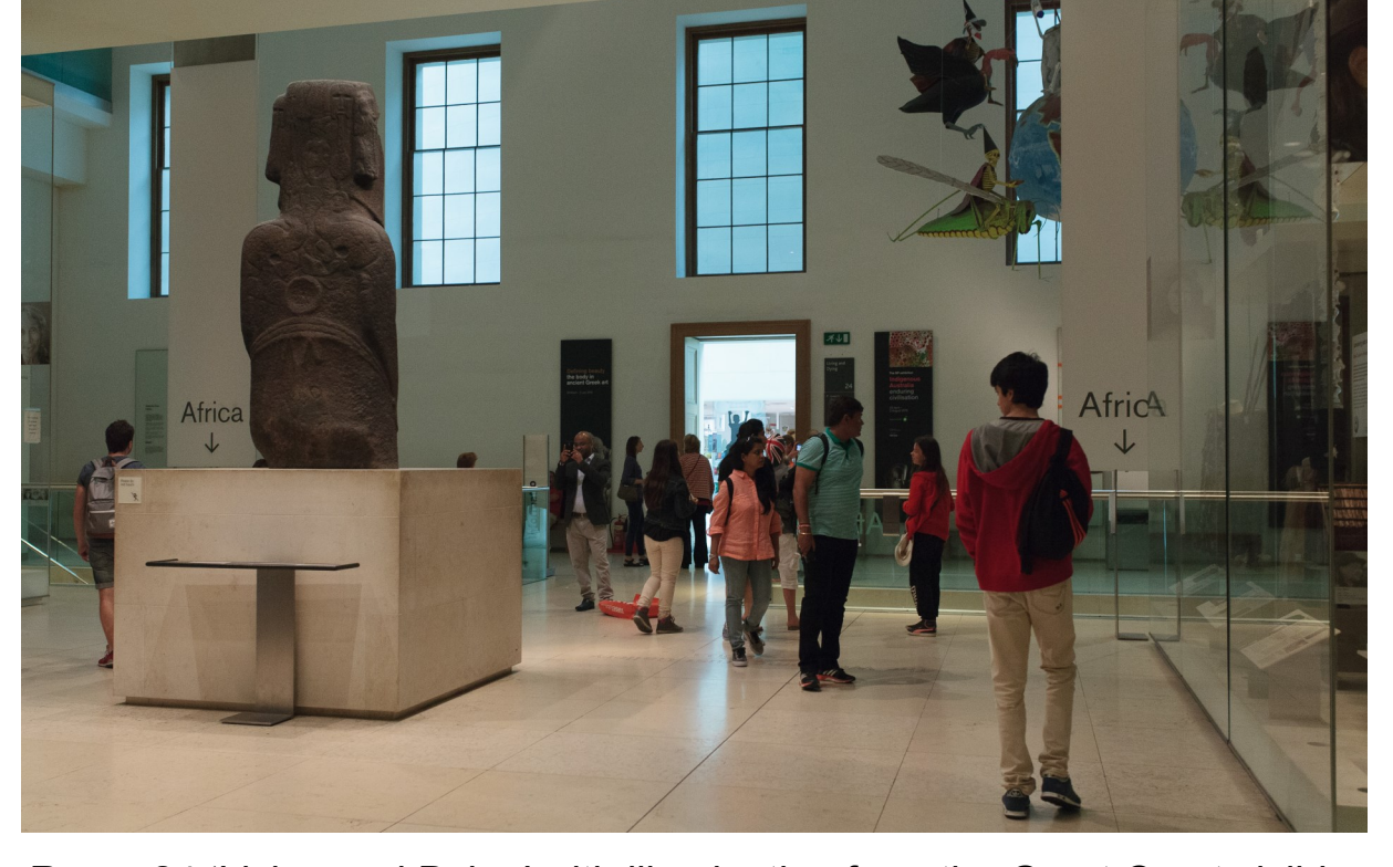
Room 24 'Living and Dying' with illumination from the Great Court visible through the door and windows.

A prime case study of this is in Room 24 at the museum where the ambient artificial lighting is warm (orange/yellow) but the neighbouring space of the Great Court, visible through a door