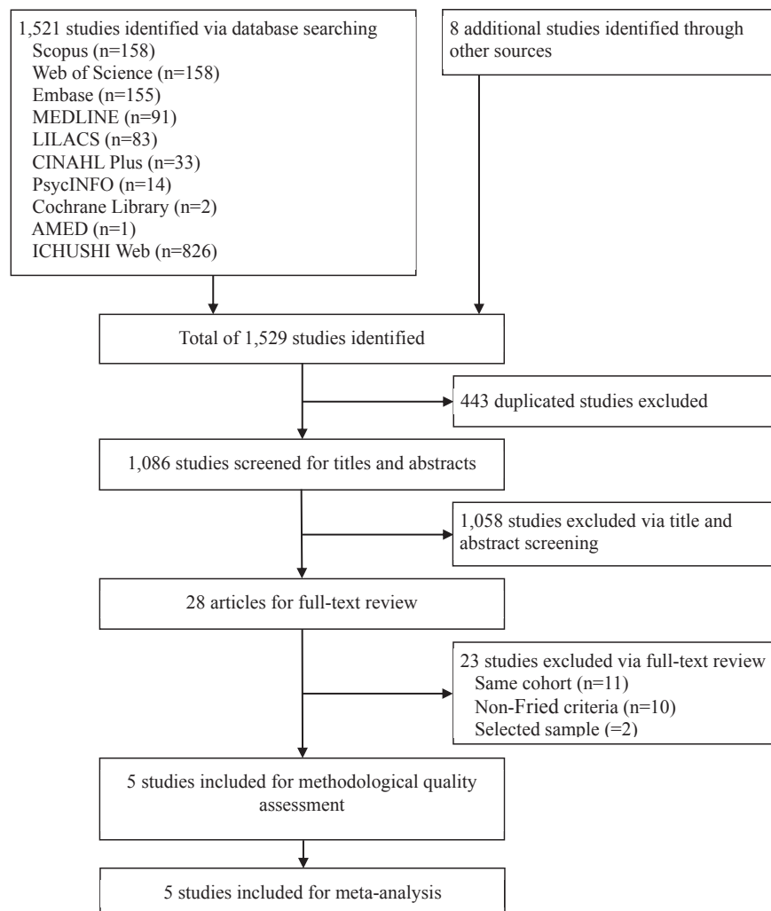
Fig. 1. PRISMA flow chart.

The characteristics of the five included studies are summarized in Table 1. Four studies 37–40 were published as journal articles, and one study 41 was presented as a poster at a scientific meeting. All studies were published in 2011 or later. Two studies 39,41 were conducted in prefectures around or near Tokyo (Gunma, Ibaraki, Chiba, and Fukushima Prefectures). The other studies 37,38,40 were from more western areas (Fukuoka, Aichi, and Kyoto Prefectures). Sample sizes ranged from 483 40 to 8864. 38 Mean age was similar among four studies at 73.3–74.3 years, 37,38,40,41 and one study did not report the mean age or age range. 39 While one study included only female participants, 41 the remaining studies were mixed, with approximately 50–70% females. 37–40 No studies used cohorts of a nationally representative elderly population. Three studies 37–39 used locally representative cohorts and two used samples originally recruited at health events. 40,41 Exclusion criteria were provided in three studies, 37,38,40 which excluded individuals with disability, 38,40 neurological and cognitive disorders, 37,38,40 or those using long-term care services. 37,38,40