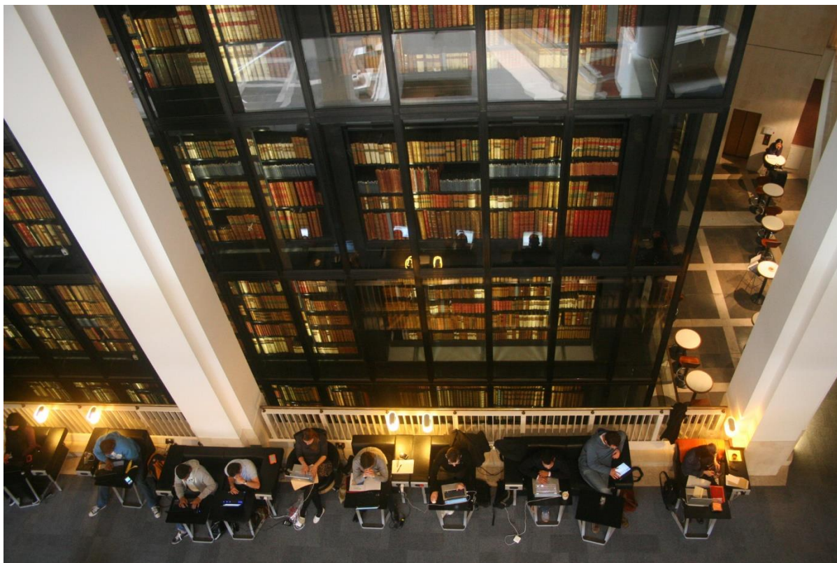
Figure 3: Laptop users in the British Library

segregated spaces. At the weekends, laptop users in general moved to more socially active locations that were again smaller and more centrally located. It was concluded that the building presented a “ layered, dynamic and changing experience rather than [...] a definite entity impacting collective user behaviour in one particular way ” 17 .