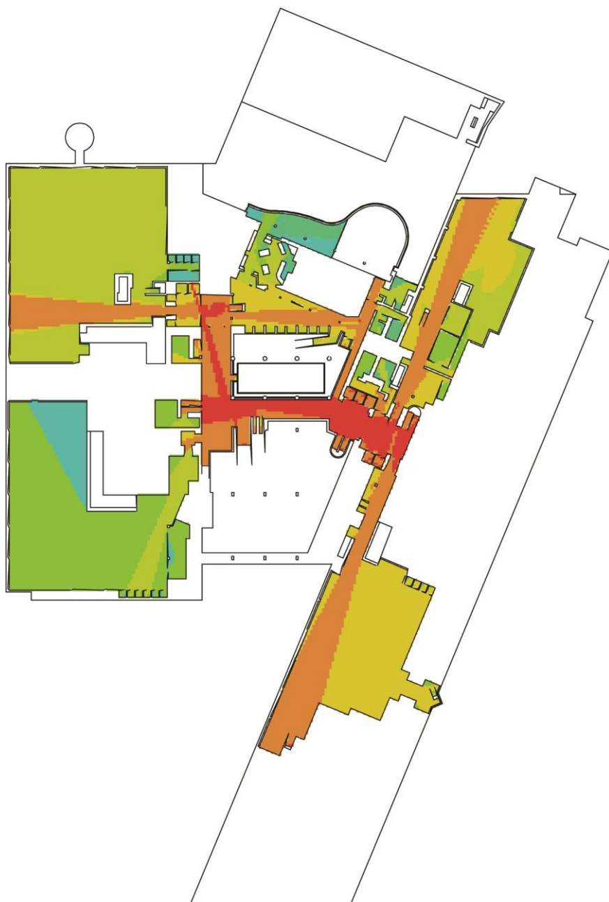
Figure 2: Visualisation of spatial relationships of visibility in the 1 st floor of the British Library; areas of shorter visible paths through the building are highlighted in warm colours whereas more segregated places are shown in cooler colours

While traditionally, space syntax considers the generic patterns of human behaviour as “relations between configurations of people and configurations of space” 3 , more recent approaches highlight how a configurational theory of space can be adapted for the interpretation of specific cultural and historical contexts. This implies a critique of space syntax theory for lacking sensitivity to temporal processes and focusing on an ahistorical ‘generalised individual’ 12 . There is also an increasing body of syntactical work addressing spatial practices and the experience of everyday social life 13,14 . Other research emphasises the individual and psychological experience of space through studies of way-finding 15 , examining how the spatial layout has an