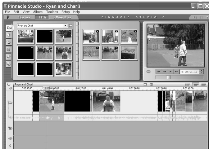
Figure: The software workspace for editing the videos

Figure 2 shows the relevant software workspace used during the video project. A timeline is clearly visible with clips loaded and options available for titling and sound effects below. Once Leo and Stephen had the camera in their hands and were assembling the piece, alternative possibilities would present themselves and the camera itself would assume a role. And once inside the editing space on the computer screen, the potential to re-design and re-assemble their intentions within a range of discourses became possible.