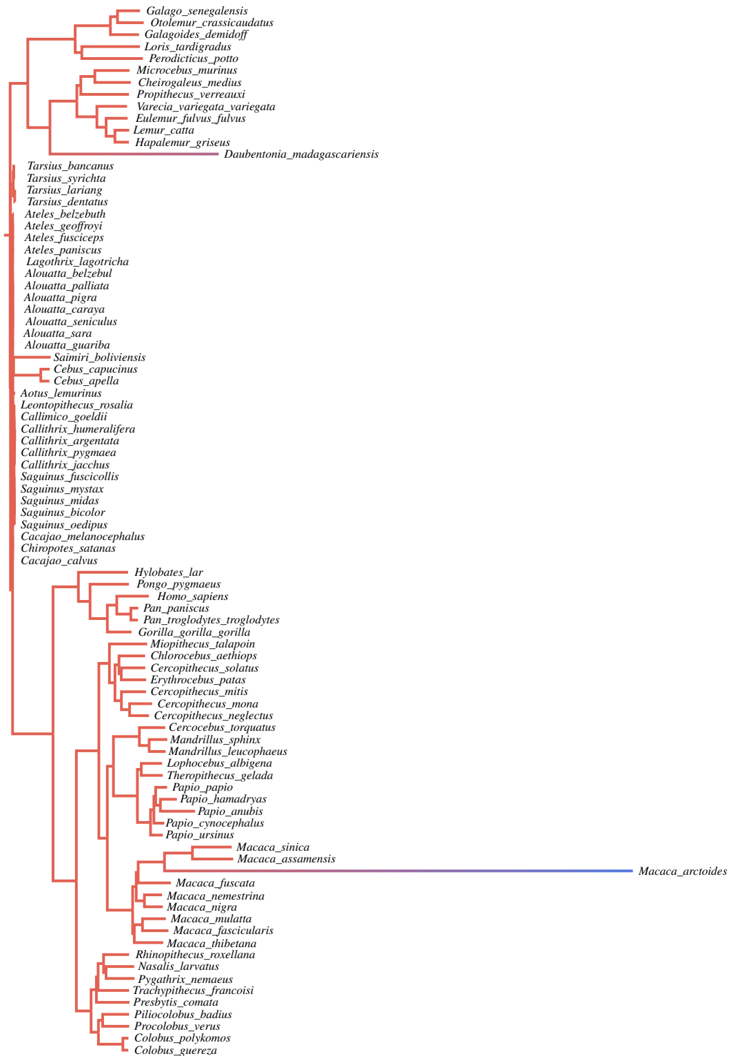
Figure 1. A primate phylogeny scaled to reflect the rate of bacular evolution. Darker red branches indicate lower rates of evolution; blue branches indicate particularly high rates of evolution.

We found positive evidence for correlated evolution between baculum presence and intromission duration in primates ( n = 299 , \log \text{BF} = 4.78 ; table 2). Ancestral state reconstructions and model rates indicate that baculum presence and short intromission durations (mean probability = 0.73) preceded a shift to prolonged intromission (figure 2). After long intromission durations had evolved, the baculum was rarely lost. However, the baculum was often lost if intromission duration remained short. Long intromission durations rarely became short again when a baculum was present. By contrast,