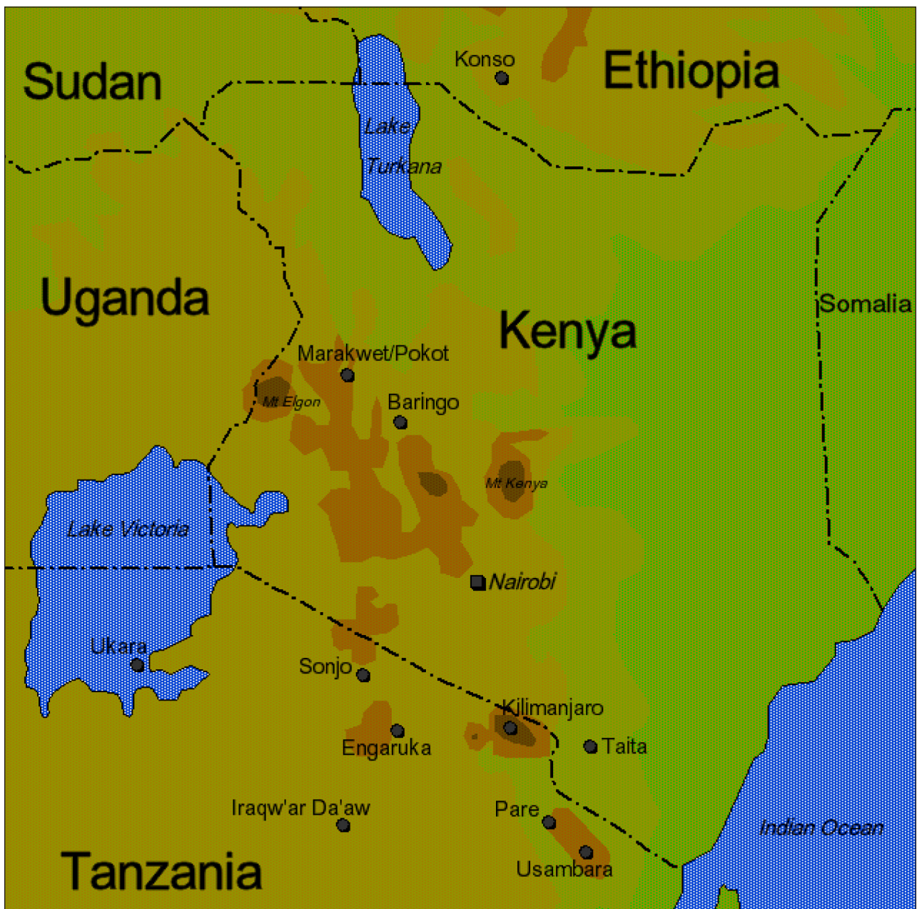
Figure 1: Islands of intensive agriculture in Eastern Africa (as mentioned in the text; modified from Widgren 2004).

of soil- and water-conservation techniques, most notably drystone bench terraces, commonly 0.5–1.5 m in height. Rainwater harvesting techniques are also widely employed, with small ridges, furrows and terrace walls constructed to channel rainwater onto fields. Small canals of mud and stone are built off temporary or minor streams and occasionally stone dams are built across these streams to increase water levels and facilitate take-off. Cattle are also stall-fed in the homestead and their manure is collected and used as fertiliser (Amborn, 1989: 73–78; Watson, 2004: 52–55).