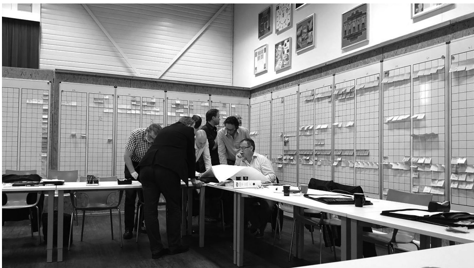
Figure 3. Typical pull-planning session for construction planning (Case C).

The cases offered insights into the adoption and implementation of BIM-enabled SC partnering. Table 8 summarises the results. The first column to the left contains the case identifiers. The next contains information on project type and scale. An analysis of BIM use as to the actors and applications is shown in the subsequent column. The following two columns show SCM adoption as to the actors and applications. The column before the last contains the description of the observed collaboration pattern of the BIM-enabled SC partnership. The last column to the right contains the