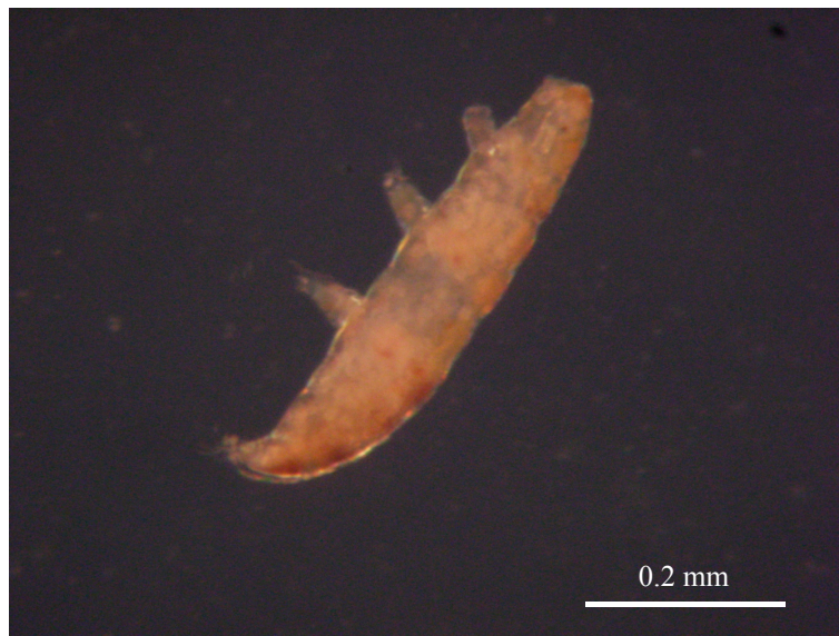
Figure 2. One of the five tardigrades which could tolerate exposure to 7.5 GPa for 12 h in a dormant (cryptobiotic) state, and then be revived by addition of water. The animal could move its legs, although slightly less energetically than other samples exposed for shorter times [40]. The resuscitated organisms were shown to survive for at least 7 days following the exposure to high pressure conditions [40]. A video documenting the remarkable recovery and swimming activity of this post-pressurization tardigrade, from which the still image is extracted, is shown in the Supplementary information and was obtained by Prof. Fumihisa Ono (Physics) in collaboration with Dr. Masayuki Saigusa (Biology) at Okayama University, with help from undergraduate students in both their laboratories. The tardigrades for the study were mainly collected by Mr. Taro Uozumi.