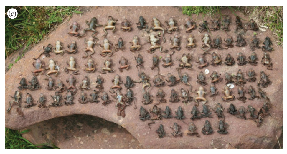
Figure 3. (a) Location of the study site (b) Lac Arlet showing the position of temperature datalogger (red arrow). (c) Mass mortalities of midwive toads Alytes obstetricans caused by Batrachochytrium dendrobatidis lineage Bd GPL at Lac Arlet.

5^{\circ} C, as European amphibians will often enter hibernation around this temperature [34]. This allowed the length of the active season (total number of possible 'active days' for amphibians) to be calculated by subtracting the Julian date of the onset of spring from the Julian date of the end of season.