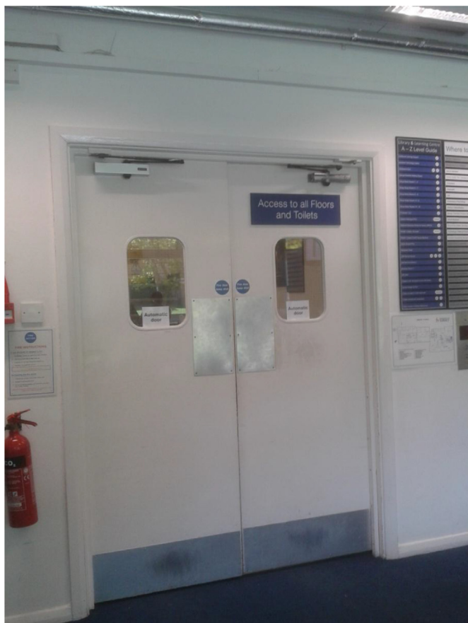
Fig. 2. Library doors with 'Automatic Door' signs in situ.