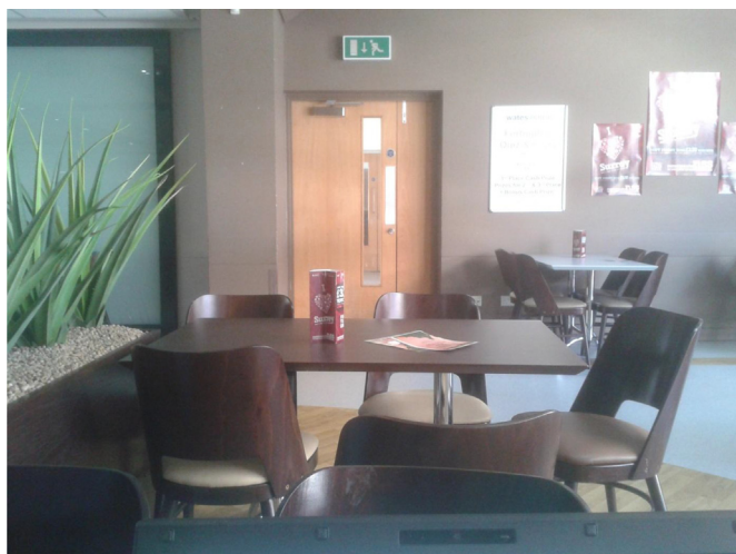
Fig. 3. Refectory door from observation site.

locations then, as predicted, people progressed more slowly when it appeared that the door was automatic. However, it is possible that the delay was caused by the time taken to read the sign, rather than the individuals waiting for the automatic system to work on their behalf. To test whether this was the case, we ran a further test in the refectory location. For an initial 79 cases, no sign was in place (control condition 1). For 60 cases, a sign saying 'Automatic door' was affixed to the vision panel (test condition) and for 65 cases, a