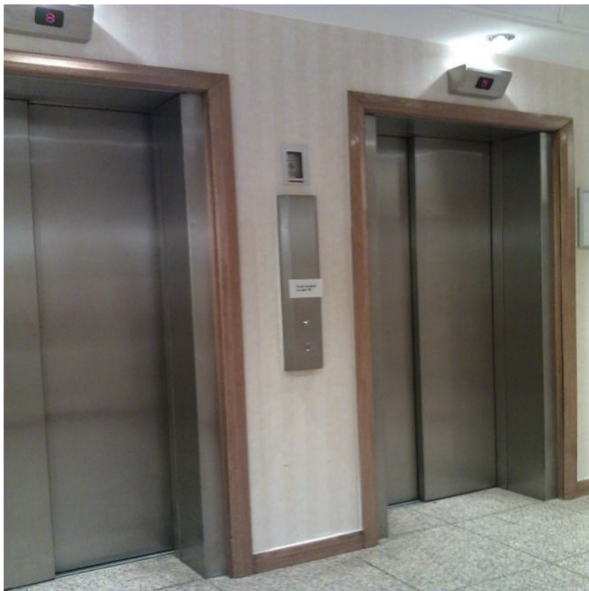
Fig. 1. Lift showing placement of label above lift call button.

In both locations, a significant difference was found: people were slower to open the door when a sign saying 'Automatic door' was in place (library: No Sign mean = 2.31, std. dev. = .34; Automation Sign mean = 2.65, std. dev. = .58; t(1, 80) = 3.19, p < .01 , effect size medium r = .33 ; refectory: No Sign mean = 2.12, std. dev. = .51; Automation Sign mean 2.45, std. dev. = .53; t(1,58) = 2.45, p < .05, r = .31 , t-tests two-tailed). In two different