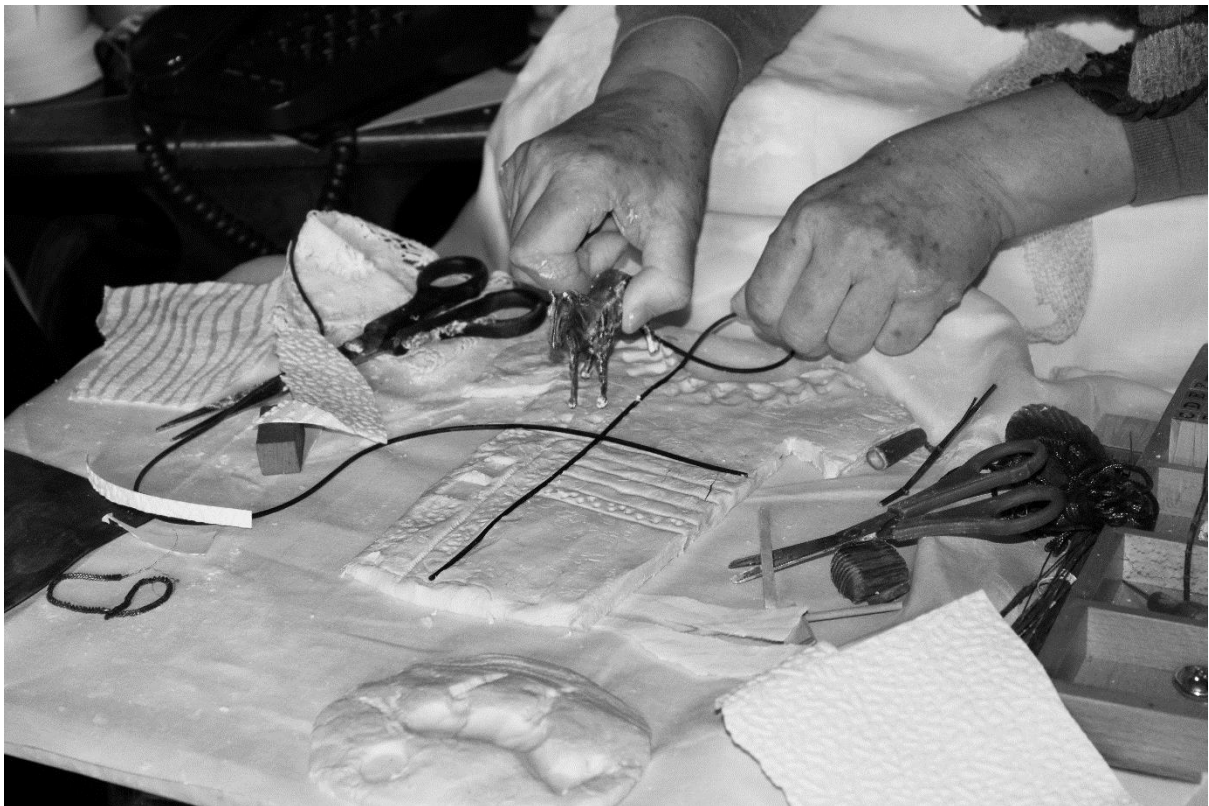
Figure 3 - Ceramics workshop on Festival in a Box visits.