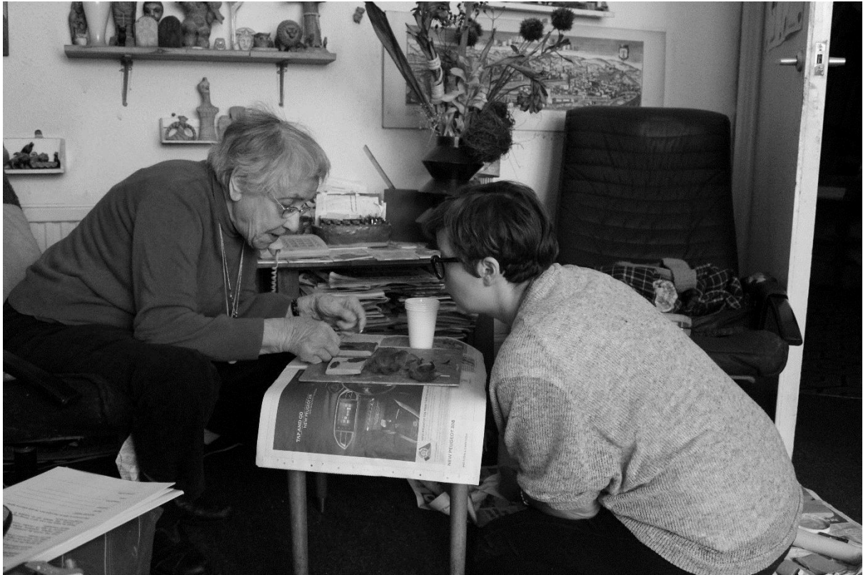
Figure 2 - Tile making on Festival in a Box visits.