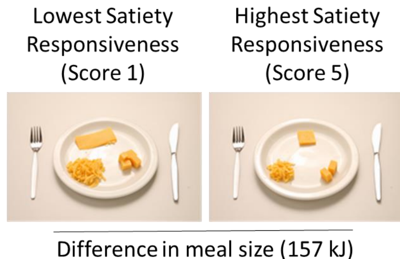
Figure 1. Average kJs consumed per eating occasion for children with the lowest satiety sensitivity score, as measured with the Child Eating Behaviour Questionnaire (score of 1) compared to those with the highest score (score of 5). The food images have been obtained from the Preschool Food Atlas. 25 The Atlas provides a range of age appropriate portion sizes to estimate food served and food leftover to children aged 1.5 to 4 years of age. The photo for the lowest satiety sensitivity score represents 18g of cheese (306 kJ), and the photo for the highest satiety sensitivity score represents 9g of cheese (149kJ), thus the difference in kJ between the two photos is 157kJ.

Figure 2 illustrates the difference in eating frequency for children scoring high (5) and low (1) on food responsiveness. Children with high food responsiveness eat more frequently and as this increase in eating frequency is not compensated for by eating less each time, they could potentially end up overeating and gaining excess weight.