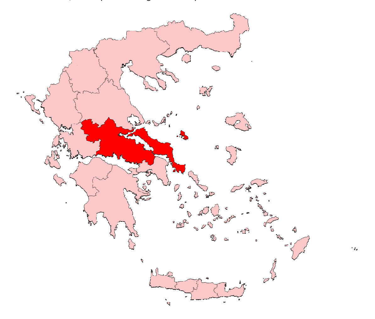
Empirical Setting Central Greece, the empirical setting of the study