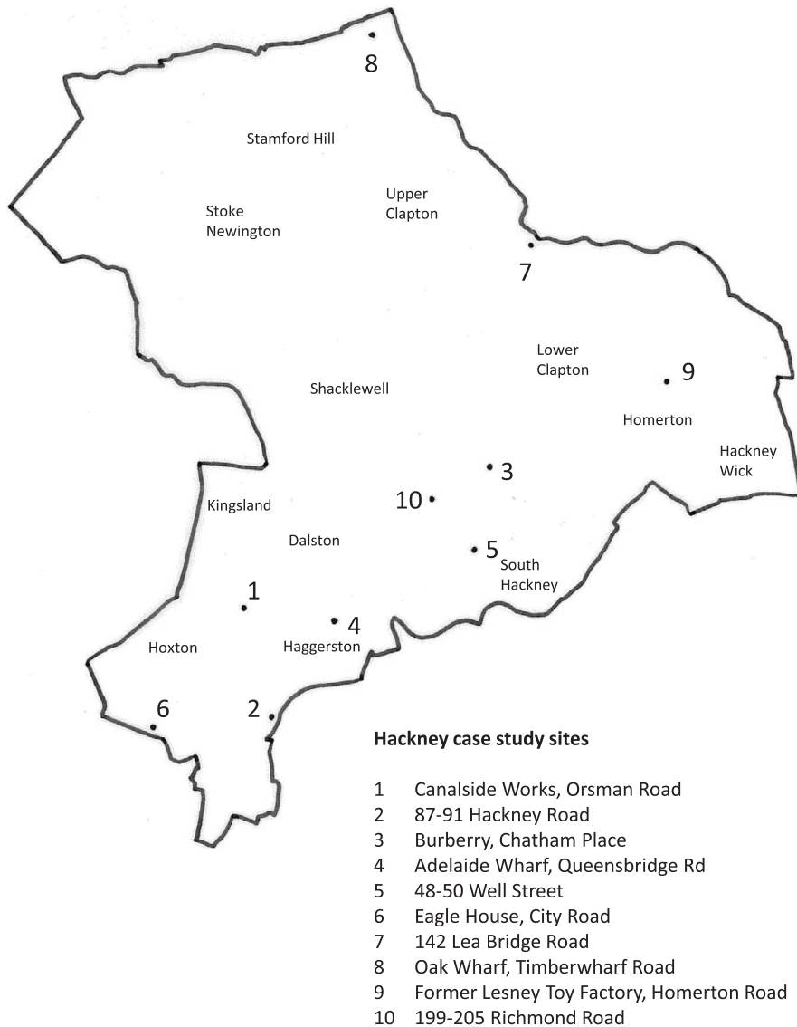
Figure 2. Location of Hackney case study sites.