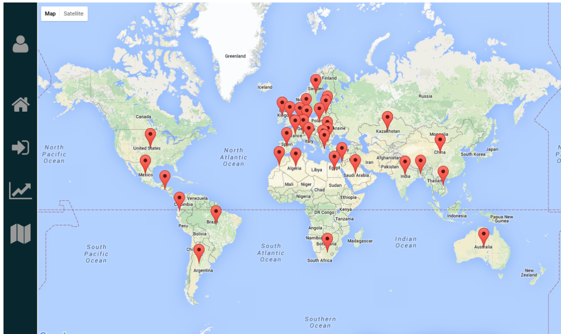
Figure 4: Location of visits to the embedded honey links.

In Google spreadsheets, there are limitations on the functionality of Google Apps Script for users that are not logged in. Since visitors are not required to login before interacting with the spreadsheets, there are limits on the amount of information we can collect on the visitors, and also how much activity we can monitor in the spreadsheets. This is an intrinsic limitation of our monitoring infrastructure.