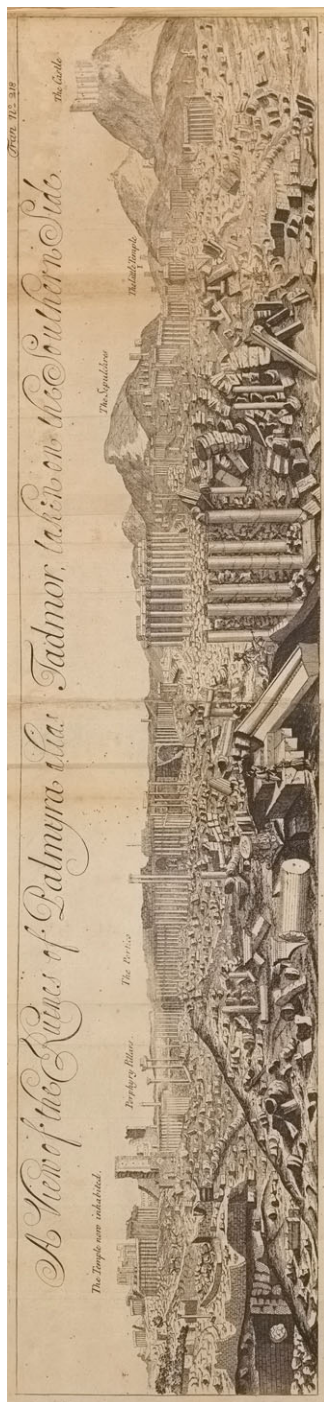
Figure 1. 'A view of the Ruines of Palmyra alias Tadmor, taken on the Southern Side'. (From Phil. Trans. R. Soc. Lond. 218 , before p. 125 (1695).) (Online version in colour.)