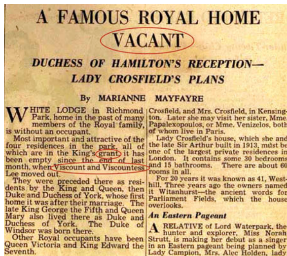
Figure 3. Newspaper passage for reading aloud. Words on which the patient made regularization errors are circled in red. [To view this figure in color, please see the online version of this Journal.]

When examined, she was noted to have an unusual personality, and to be distractible and garrulous. It was commented that “on hearing her prattle, nothing strikingly abnormal was at first noticed but mistakes were detected not expected in her stratum of society”. Examples included “recovered me” for “cured me” and “I am very physical” for “I am very healthy”. Although her speech was well articulated and grammatical, she was noted to make frequent use of circumlocutions and to have particular difficulty finding names. The patient was unable to name a pencil, torch, tape measure, or towel. There was further evidence of a “gross agnosia” for words. She brought with her extensive lists of words whose meanings she no longer knew, prepared with the assistance of a friend (Figure 2); examples include “kettle”, “sauceman”, “floor”, “fountain”, and “desert”. She was able to repeat words normally. Reading aloud from a newspaper clipping (Figure 3) was