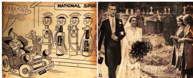
Figure 4. Pictures for assessing visual object recognition. See text. [To view this figure in color, please see the online version of this Journal.]

This patient exhibited many of the clinical features we would now regard as classical for the SD syndrome. She presented with progressive fluent aphasia manifesting as early severe anomia and loss of comprehension of words. She also demonstrated loss of vocabulary-based reading and spelling characterized by a surface dyslexia and dysgraphia but with intact grammar, phonology, and repetition. Indeed, these language features would have fulfilled current consensus diagnostic criteria for the “semantic variant” of PPA (Gorno-Tempini et al., 2011); in addition to this leading deficit of verbal semantic memory, there