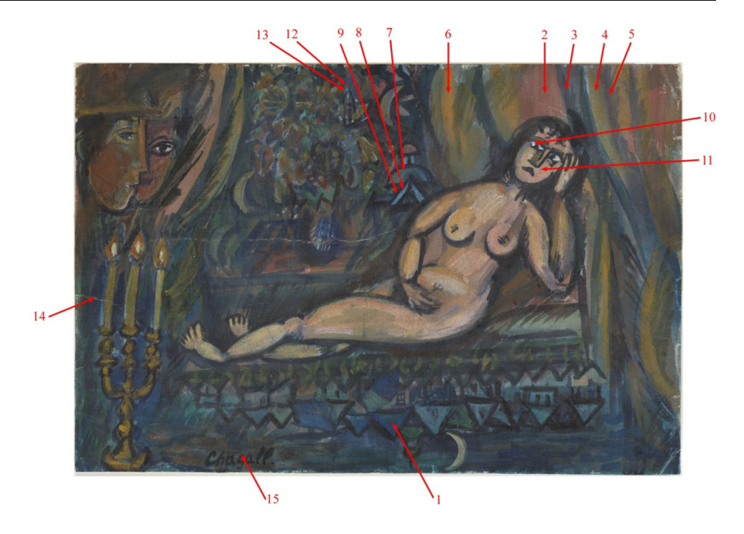
Fig. 1 Digital image of Nude Woman Reclining , with analysis sites indicated

at the painting's surface of about 0.4–0.8 mW. Spectra were recorded in the range 2500-100 \text{ cm}^{-1} by collecting 10–30 accumulations each with a duration of 10 s and an estimated spectral resolution of 1 cm<sup>-1</sup>; spectra were calibrated using the 520.5 \text{ cm}^{-1} band of a silicon wafer, and background correction was necessary.