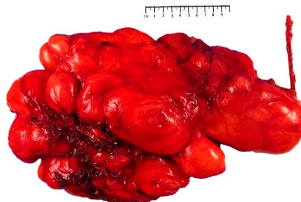
Figure 1. Large bosselated ALT which appears to be completely excised and covered by a thin film of loose fibrous tissue (marginal excision). Maximum dimension of tumour = 240 mm.

In addition to the 90 cases of ALT included in the primary study ( vide supra ), an extended search of our archive revealed an additional 175 cases giving a total of 265 cases that presented to the RNOH between 1997 and 2014. Of these, 155 cases presented after 2009 and, therefore, had limited follow-up. Furthermore, 18 of this extended group presented at RNOH with recurrent disease. One of these recurrent cases (thigh) presented at RNOH 40 years after the first excision. Twenty-six (including eight in the primary study) of the 265 (10%) cases presented with recurrent ALT: 19 (73%) recurred once as ALT and 7 (27%) recurred more than once as ALT: 3 of the latter ( n = 7 ) presented as secondary DDLS on the final recurrence. Details of these seven tumours are shown in Table 2. The mean size of the recurrent tumours was 143 mm (range 40–250 mm). Only two cases measured less than 100 mm. The majority (89%) of these tumours were resected with a complete/marginal excision margin.