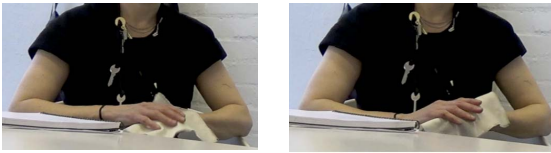
Fig. 2. Fashion 1 active and passive touch.

Interviewer: So when you feel with other parts of the hand, what does it feel like? How do you do that?