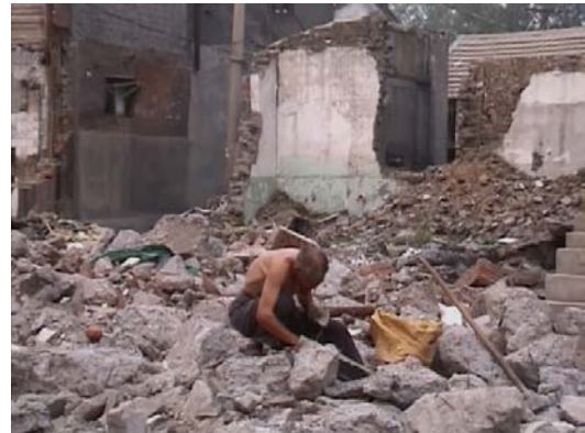
Meishi Street (2006)