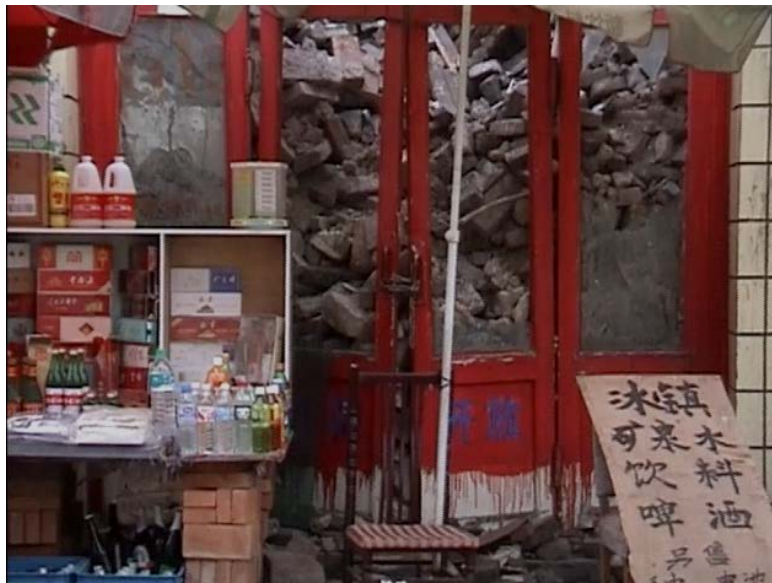
Meishi Street (2006)

'In China, what makes an image true is that it is good for people to see it'.