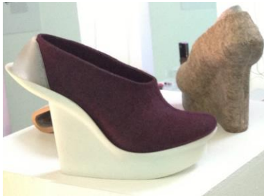
Figure 6. The sensory: materiality and 3D printing, ©Liz Ciokajlo.

deconstructed and absent in an experimental context, the body is situated in a 3D virtual environment of a maze using a first-person view controlled by a mouse device (Figure 3), and data is captured using system log files. There is a lack of connection between the movement within the maze, and the movement of the physical body. In the digital arts research sites we also find an exploration related to the augmented body with a critical approach to what and how are the boundaries between body and technology. For instance, in FDS-LCF, a 3D game of fashion and social interaction developed by the fashion designer Makryniotis represents the body digitally using a third-person view with avatars, stressing the symbolic connotations of what you wear, with a lack of connection to the physical body, and connected to critical design methods (Figure 4). In the 5 case studies, moving from the physical to the virtual/digital back to the physical seems to be a key aspect of how the body is engaged with through the digital. What are the methodological implications of using different viewpoints and how to re-think methods for understanding situations with varied digital representations of the body are questions of interest to MIDAS.