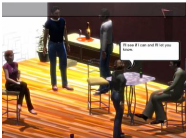
Figure 4. The body: third-person view with avatars in 3D, ©Thomas Makryniotis.