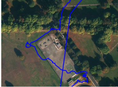
Figure 2. The body: third-person view on a 2D digital map.