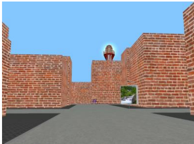
Figure 3. The body: first-person view in a 3D maze, ©ELSTRAD.