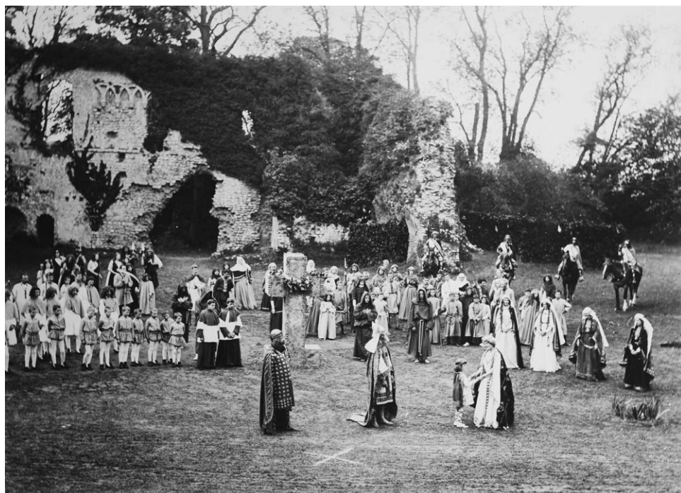
Figure 3. The death of Ethelbald: scene from the Sherborne pageant of 1905.

rituals elsewhere, pre-war values were modified, applied to the horrors of war, and recast in a post-war context.