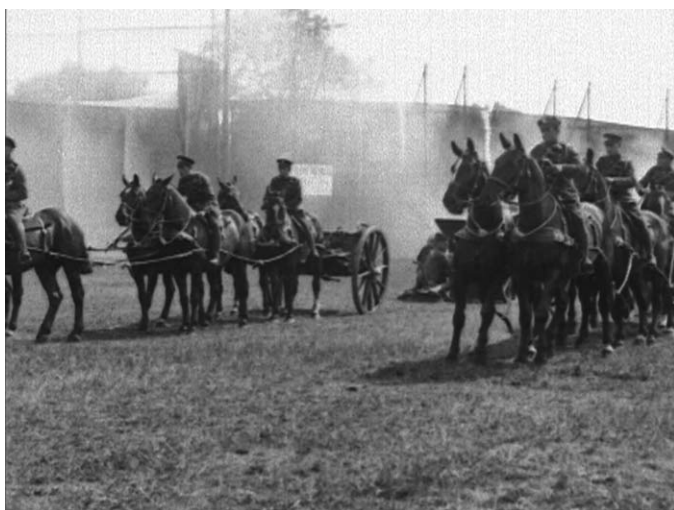
Figure 2. Scene from the St. Dunstan's Pageant of Peace, 1919.

artillery smoke billowed in the background; objects fell from the sky; confusion reigned. In a later scene, wounded servicemen were taken away on stretchers, as medics attended to others. Valiant soldiers carried their comrades on their backs. In a matter of minutes, the retreat from Mons had been vividly recreated for thousands of watching civilians. 1 Such scenes were repeated in many other British cities in the summer months of 1919, as the St. Dunstan's Pageant of Peace travelled round the country (see Figures 1 and 2).