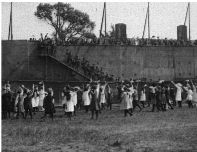
Figure 1. Scene from the St. Dunstan's Pageant of Peace, 1919.