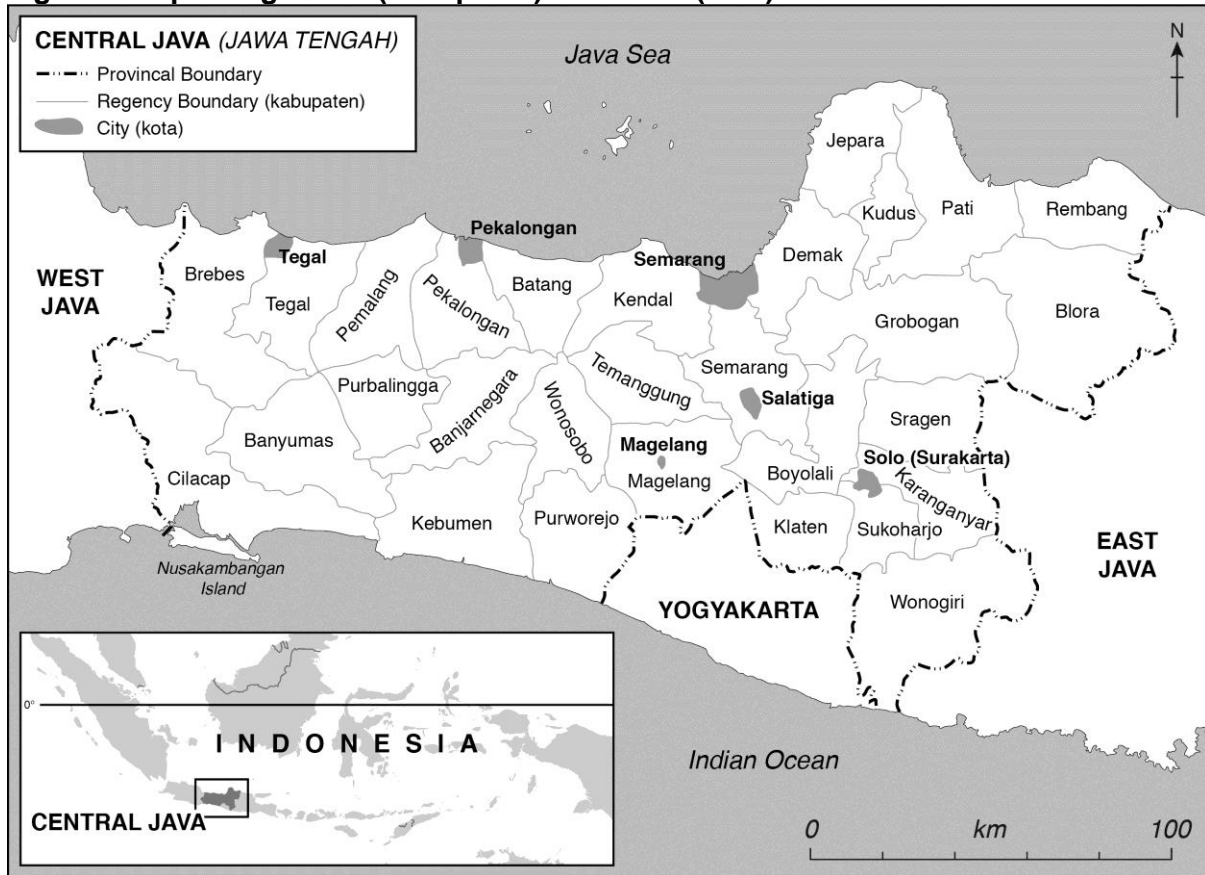
Figure 1 Map of regencies (kabupaten) and cities (kota) in Central Java