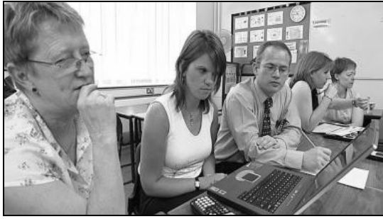
Figure 1 The department at Tanbridge House School, UK discussing The Number Line tool .